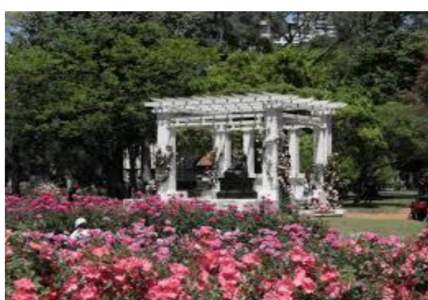
2014 Rosedal Park, n : 73