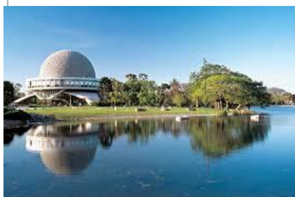
2012 Planetario place, n : 123