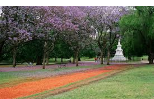
2016 Patricios Park n : 117