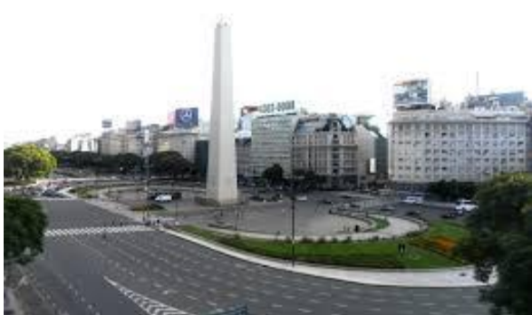
2015 Obelisco surroundings n : 172